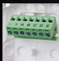
Adjustable terminal block