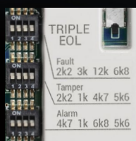
Built in EOL resistors