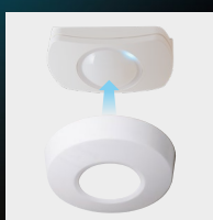
Ceiling mount cover